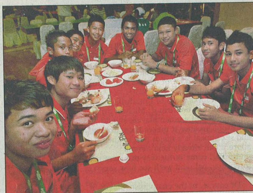
Singapore's young footballers tucking into hotel fare at the dining hall on the Village's second floor. The meal was served up as a buffet.